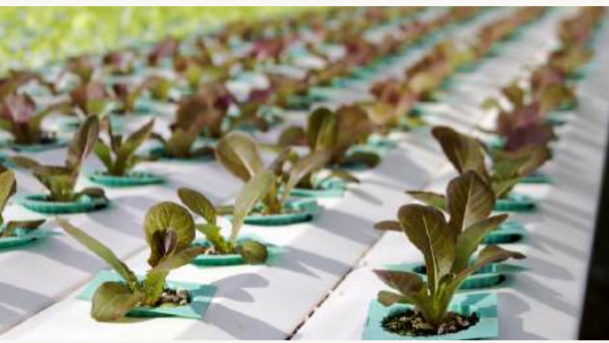
Hydroponic Salad Bar

This initiative supports our goal of providing delicious and health-conscious seafood options while maintaining ecological balance.