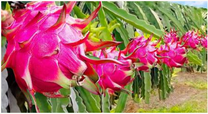
For the Love of Dragon Fruit

The excursion wraps up with a trip to a nearby village, showcasing the charm of rural life and fostering economic support for these locales.